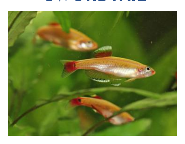
WHITE CLOUD MINNOW